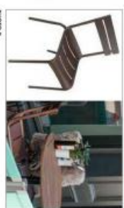
PHOTO 2 SEATING CHAIRS, USE EXTERNAL CHAIRS. QUANTITY: 2000. SEE REF PHOTO 3 X 1.500MM SPACING. MATERIAL: UNCOLOURED ALUMINIUM. WIDTH: 300.