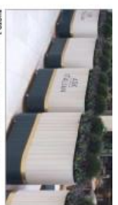
PHOTO 1 REINFORCED CONCRETE TREATMENT TO SEATING AREA. EXPOSED REBAR. SEE REF PHOTO 2 X 1.500MM SPACING. CONCRETE SECTION IN CASE BLUE BRICKWORK SAND AS PER PLAN. ALL PLANTING TO BE RIVERCA PLANTS.

turnerbates DESIGN & ARCHITECTURE Project: ASK Italian - Landis Lane Unit 21 Client: Albert Chao Design Title: Proposed Seating Area Plan Drawing: TB_15_1228_501 Rev: 03 Scale: 1:100 @ A3 Date: July 2017 Author: [Name] Checker: [Name] Designer: [Name]