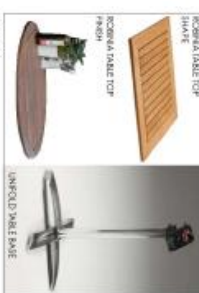
PHOTO 3 SEATING TABLE TOP. QUANTITY: 1000. SEE REF PHOTO 4 X 1.500MM SPACING. MATERIAL: UNCOLOURED ALUMINIUM. WIDTH: 300.

PHOTO 4 SEATING TABLES. REBAR. SEE REF PHOTO 5 X 1.500MM SPACING. QUANTITY: 1000. SEE REF PHOTO 6 X 1.500MM SPACING. MATERIAL: UNCOLOURED ALUMINIUM. WIDTH: 300. PROPOSED COVERS FOR EXTERNAL SEATING AREA: (SEE PLAN) RED LINE INDICATES EXTENT OF AREA FOR LICENSABLE ACTIVITIES DOTTED LINE INDICATES EXTENT OF AREA FOR LICENSABLE ACTIVITIES (RED LINE) 320 SQ FT / 30.3 SQM